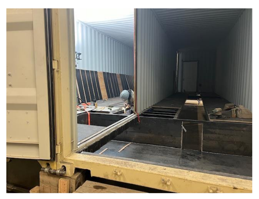
Figure 3 - Header House #11 under construction. MU-3 and beyond header houses will accommodate twice the number of wells as previous header houses

Construction activities related to the preparation of the MU-3 surface facilities commenced during the quarter. The Header House #11 building along with internal piping manifolds are being fabricated on-site by the in-house construction team. In the field, large diameter trunk lines have been prepared for MU-3.