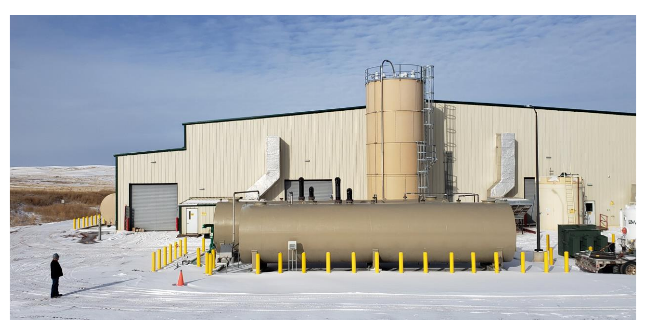
Figure 1 - The new acid storage vessels at the Ross Plant-Lance

The Company has completed the modification of the existing Lance plant facility to enable the processing of low-pH ISR solutions at the facility. Acid storage and distribution facilities are fully installed, and the process plant plumbing has been reconfigured.