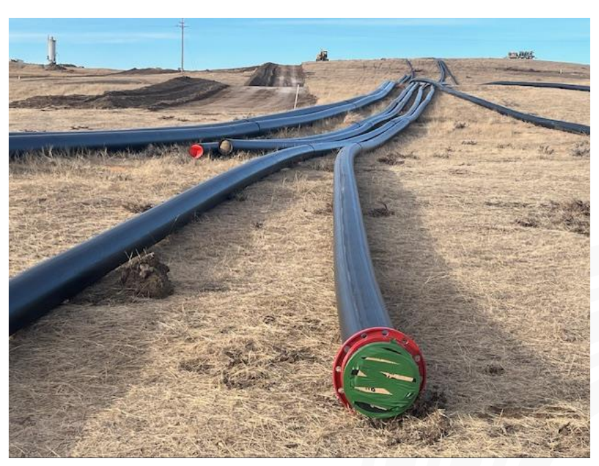
Figure 4 – Large diameter pipelines being prepared for MU-3