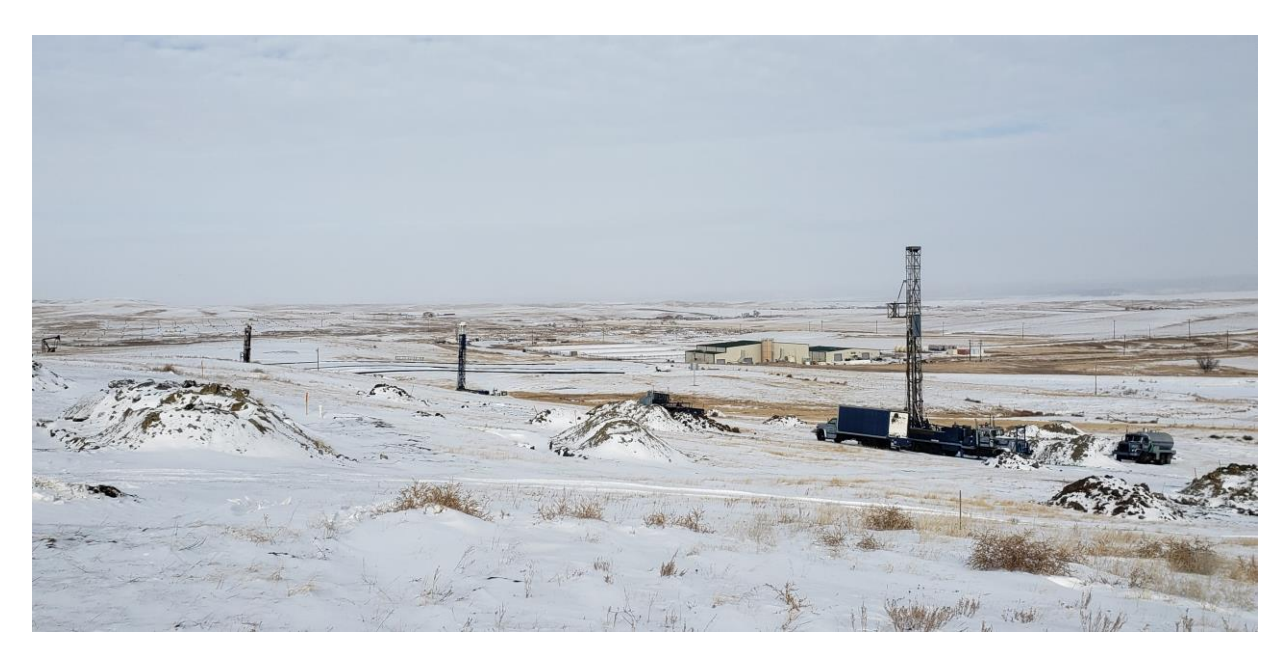
Figure 5- Multiple drill rigs working within MU-3 area. The Ross plant facilities are seen in the background

During December, a seventh drilling rig was contracted for the project development with all drill rigs now working on well installation in MU-3.