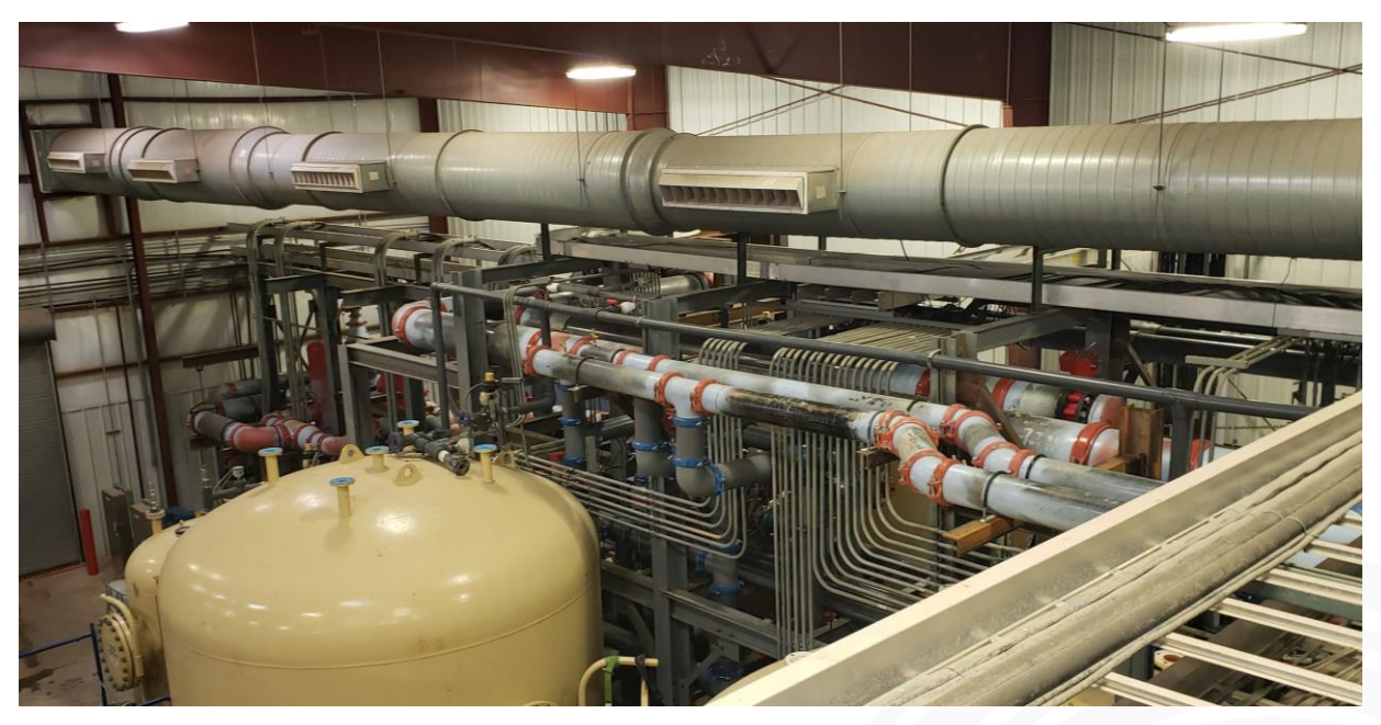
Figure 2 – Modified piping systems within the Ross Plant-Lance

On 31 August 2023, the Company announced its intention to expand the existing Lance plant facility production capacity from 0.8 Mlbs p.a. to approximately 2.0 Mlbs p.a. The Company is also adding the capability to produce a saleable dry yellowcake product at the Lance plant facility so that it will no longer be dependent on third party toll-milling services. Final engineering work for the plant capacity and