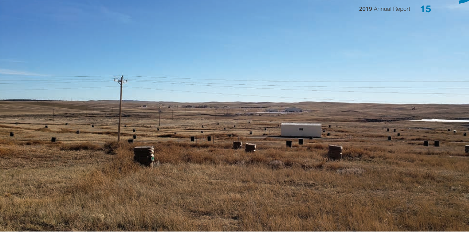
Figure 4: Mine Unit, Lance Projects, Wyoming, USA

As at 30 June 2019, a total of 35 employees are directly employed on the project (excluding drilling and geophysical contractor personnel).