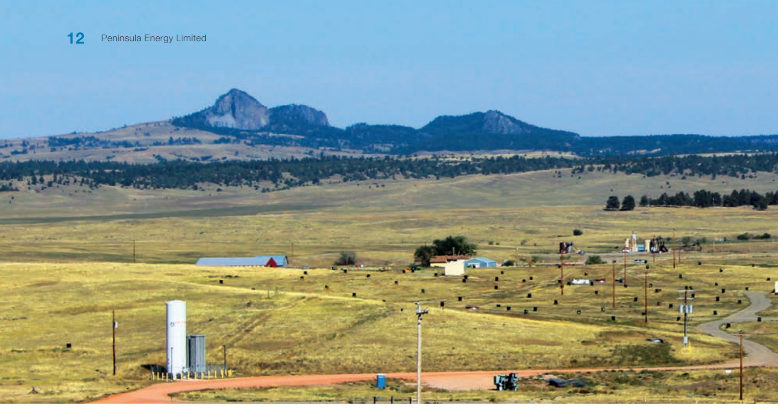
Figure 3: Lance Projects, Wyoming USA