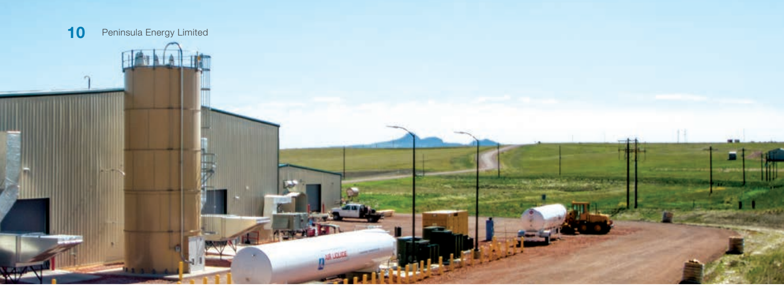
Figure 1: Lance Projects, Wyoming USA